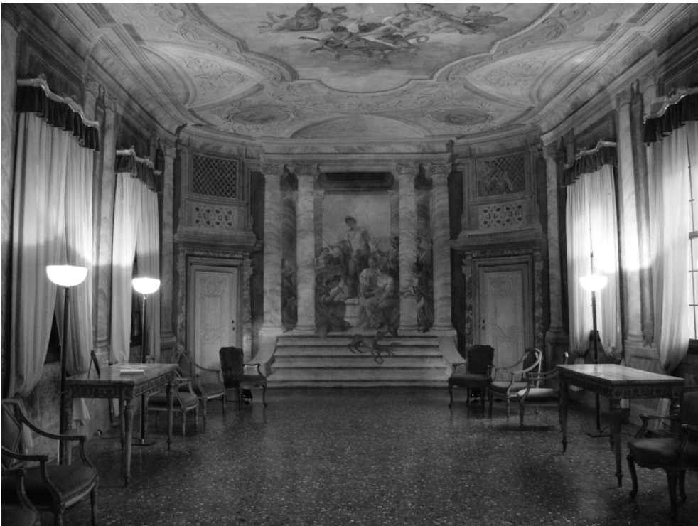
Illustration 3: The Sala di Musica, Ospedaletto.